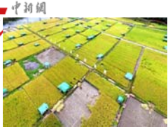
Farmers harvest ratooning rice in south China's Guangxi