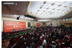
Press conference held on CPC united front, external work