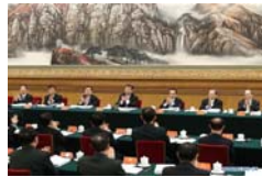
Xi presides over 2nd meeting of presidium of 19th CPC National Congress

Copyright ©1999-2017 China Daily News Service. All rights reserved. Without permission is prohibited.