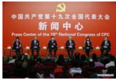
Group interview held on implementing strategy of innovation-driven development