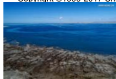
Aerial photos of Qinghai Lake in NW China