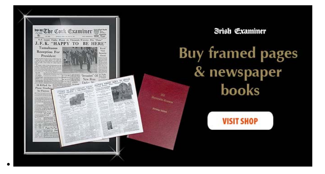
More From The Irish Examiner