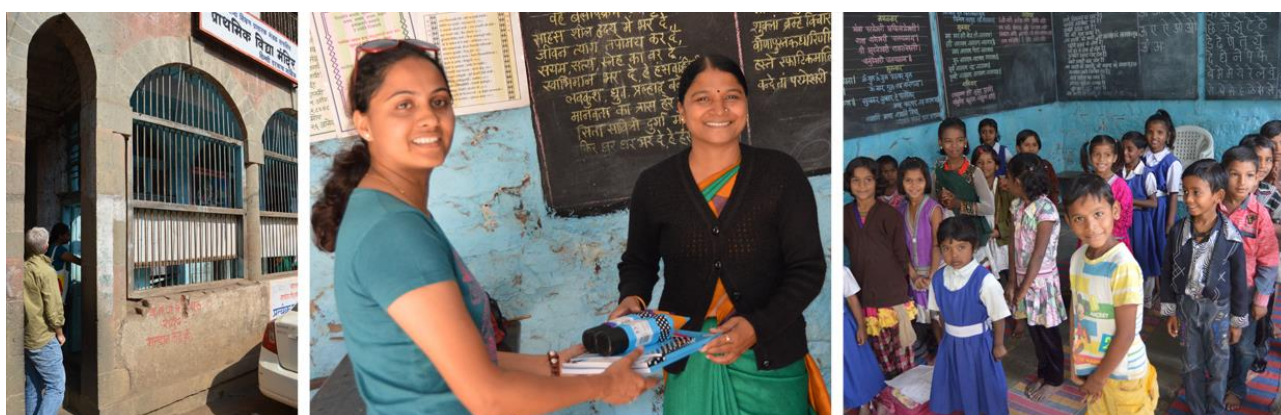
Left to right: during a visit to a local school in Nashik, a message (out of shot) – “please do not urinate here” is daubed on the exterior school wall.