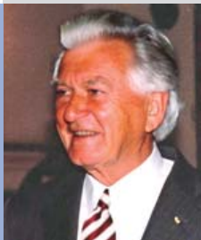
Hon Bob Hawke AC

Transforming the way young people acquire the technical, social and learning skills needed in the 21st century.