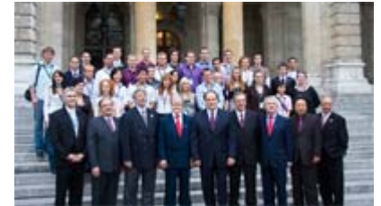
The Youth Forum participants and the Board of Directors in front of Vienna City Hall

The WSYF participants discussed and made recommendations with respect to 6 topics, taken from the 2008-2011 WorldSkills Action Plan. These recommendations, embodied in the WSYF Report, will be reviewed by WorldSkills International in the near future, with a view to implementation where appropriate.