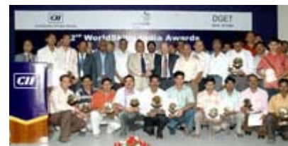
Tata Motors received the Best Company award for the National Skills Competition

For more information please visit: www.ciionline.org