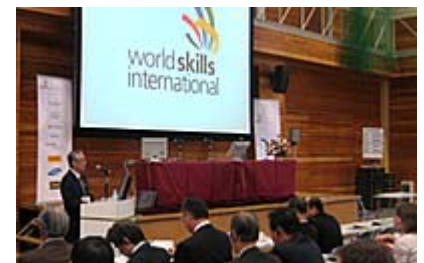
The Vice Governor of Shizuoka welcoming the VIPs to the WorldSkills Leaders Forum

The WorldSkills VIP Experience is a programme designed to present the WorldSkills Competition experience - and the WorldSkills Movement - to key Government, Industry and Educational decisionmakers from around the world. For the VIP Experience participants it represents an opportunity to network and share knowledge with their counterparts from around the World; and from our Members' perspective it represents a fantastic way to win the hearts, minds and support of key decisionmakers in their country/region. As outlined in the WorldSkills News Section above, key VIP Experience 2009 program information will be released at the WorldSkills General Assembly in Vienna, but in the interim we encourage all WSI Members to identify key stakeholders in your country/region who would benefit from participating, and advise them to keep September 1-6, 2009 free in their diaries.