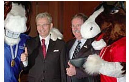
Minister Solberg & Richard Walker with the Calgary 2009 mascots, Tug & Tess

Youth Awareness is an initiative, funded under the Employment Insurance (EI) program that complements the Government of Canada's Youth Employment Strategy. Youth Awareness projects are delivered at the national, regional, and local levels. Youth Awareness provides financial assistance for projects designed to address labour-market issues that face communities, which can be used to develop and implement human-resource strategies to meet employers' current and future human-resource needs.