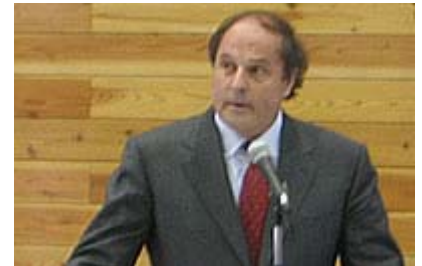
Re-elected President, Tjerk Dusseldorp

Tjerk Dusseldorp thanked the Members for their vote of confidence and promised that the Executive Board would continue the strong leadership and governance as the organisation enters the most exciting period of its 57 year history. The period 2008-2011 has WorldSkills Calgary 2009 and WorldSkills London 2011 - both promising further development plus greatly increased media coverage. WorldSkills International formally adopted (unanimous support by the General Assembly) its 2008-2011 Action Plan "Releasing the full WorldSkills potential" - this provides a focus and framework to better guide, coordinate and integrate the many exciting and progressive initiatives already under way.