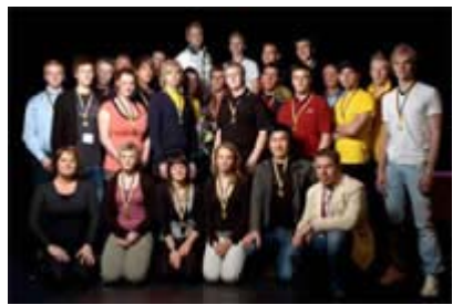
Team Sweden for WSC2007

Swedish Skills Championships, established 2004, now take place every second year. The championships are qualifiers for the WorldSkills Competition. Swedish Skills Championships were held in Göteborg, May 17-20 2006, and 360 young people participated in more than 40 skills. This resulted in a Swedish team for Japan consisting of 32 competitors in 29 skills - the biggest Swedish team ever! The next Swedish Skills Championships will be held in Jönköping in May 2008, qualifying for Calgary 2009.