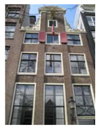
WSI Secretariat's new office

Tel: +31 23 531 1071 Fax: +31 23 531 0816