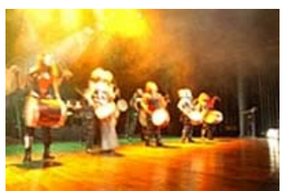
Portugese National Competition: Closing Ceremonies