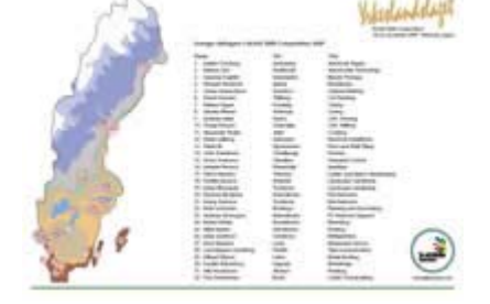
Map showing where the 2007 Team Sweden competitors live.

In 1995 the first Swedish national team was formed. It was time to challenge the rest of the world who had been