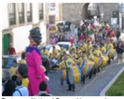
Portugese National Competition: opening parade

For more information please visit: portal.iefp.pt