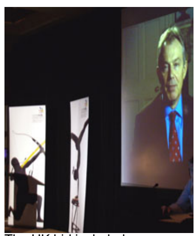
The UK bid included a message from the Prime Minister Mr Tony Blair.

The voting proceeded with the UK winning by the required absolute majority in the first