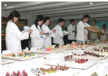
Judging the Confectionery

For the new skill of Robotics the host organisation invited three professors to develop the “Nanxun No.1” security robot, which can detect an intruder, fire, gas leakage and controls appliances.