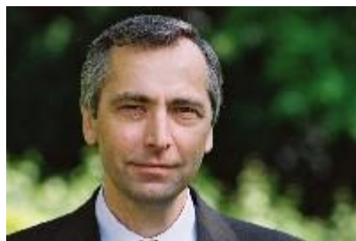
Commissioner Jan Figel' - Member of the European Commission, responsible for Education, Training, Culture and Multilingualism'

EuroSkills will be held as a regional competition of WorldSkills International. It is seen as providing a much needed "step up" for countries which have still to join WorldSkills, as well as helping to address issues central to the European agenda on education and training.