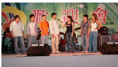
The night before the Competition, the competitors relaxed to an evening of live entertainment provided by the host organisation.

The competitors had to accomplish the assigned work within 22 hours, spread over the three days of the Competition. It not only tested their skills, but also challenged their physical strength.