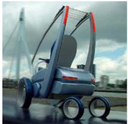
The Scoozy scoot mobile

HAZERSWOUDE-DORP – Skills Netherlands' member Bureau TOP, an organisation that promotes technology to young students, has the support of various Dutch manufacturers and supply industries. Thanks to this support the national competitors can perform at their best. The participants in the vocational competitions donate several machines, materials and software. One of the examples is Spark Design Engineering who provides the design of a scoot mobile called Scoozy, to which all competition projects of the national vocational competitions final are related.