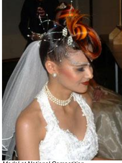
Model at National Competition

Proudly supported by WorldSkills Founding Global Sponsor Partners