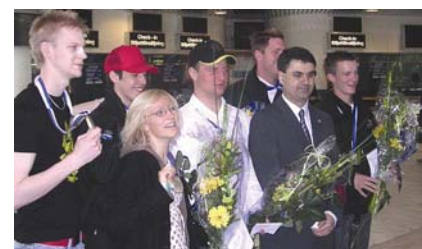
Minister of Education Ibrahim Bylan with some of the Swedish team.