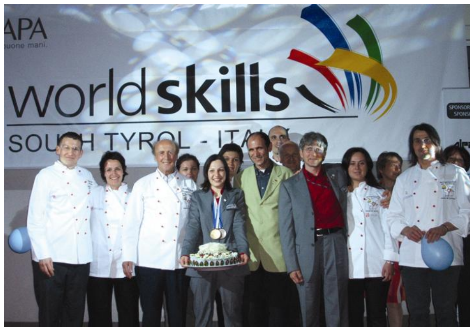
Young craftsmen from South Tyrol obtain dream score of 11 medals.

On June 2nd, the 20 members of the South Tyrol team landed at Bozen airport to be met by a gigantic welcome party of almost a thousand people. The party was to welcome the team home and celebrate the 11 medal winners from the 38th WorldSkills Championship.