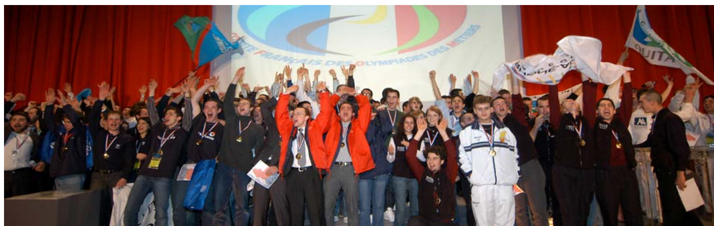
Pictured is the French team who will represent France in the upcoming WorldSkills Competition