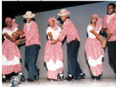
The Ebony Park Dancers bring back the good old days of the Quadrille

Jamaica has received a double number of applications (from 300 to 600) since they became a WorldSkills Member in comparison with the previous years. "Youngsters are very keen to participate in an international competition where they can become a World Champion in a particular skill".