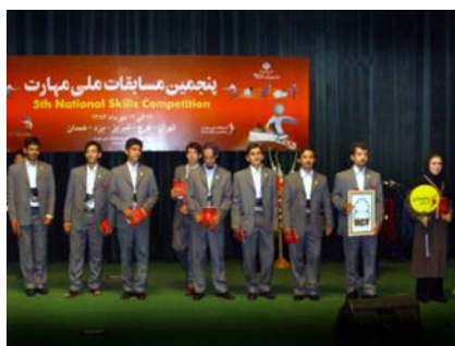
Closing Ceremony of national competition in Iran