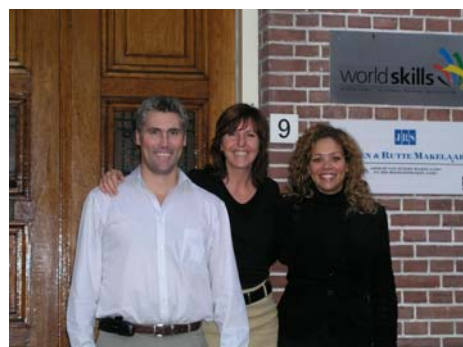
Pictured is the Secretariat team in front of the office in Haarlem, the Netherlands