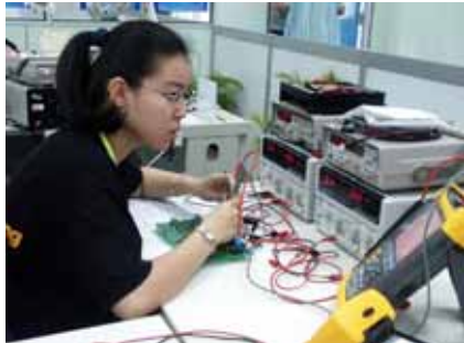
In deep concentration: Industrial Electronics competitor at work.